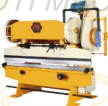
MECHANICAL/PNEUMATIC PRESS BRAKE 610 x 1 mm to 3125 x A mm