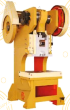
C TYPE POWER PRESS