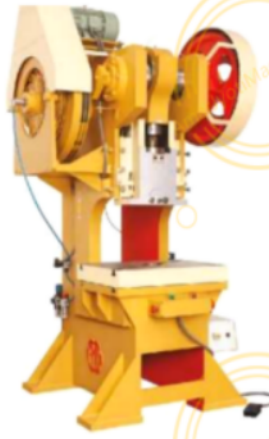
PNEUMATIC POWER PRESS