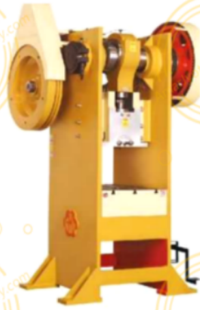
H TYPE POWER PRESS