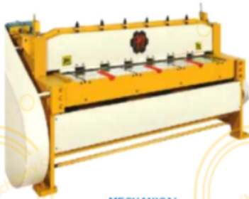
MECHANICAL UNDER CRANK SHEARING 610 x 1 mm to 3125 x A mm