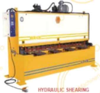
HYDRAULIC SHEARING 1500 x 3 mm to 8000 x 25 mm